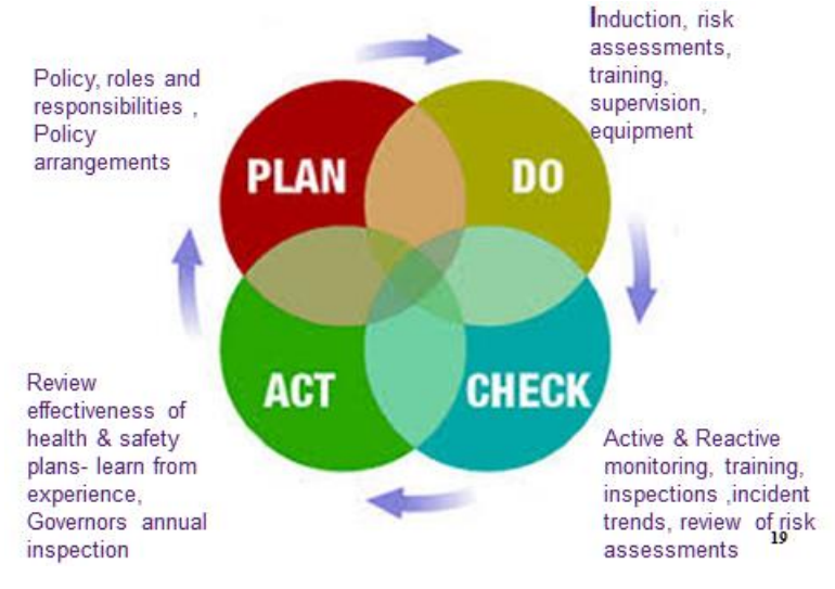
Figure 1: Health and Safety Management System (HSMS)

The diagram below shows a pictorial representation of the Health and Safety Management System or management cycle .