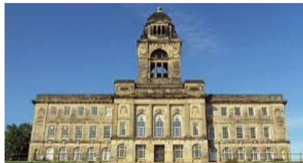
Wallasey Town Hall